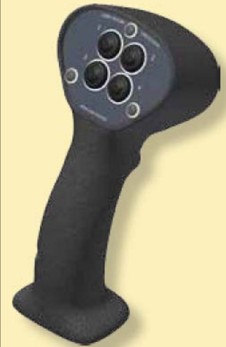
Shown Without Cable